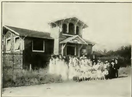
NAPA, CALIF. HARMONY, (Chapel)